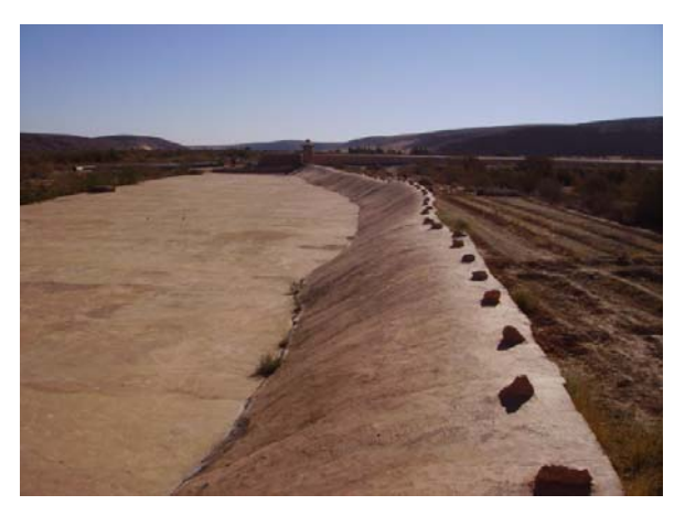
Phot. 2. El Atteuf dam