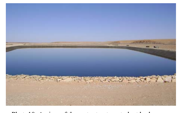
Phot. 10. A view of the water treatment plant by lagoons the M'zab Valley