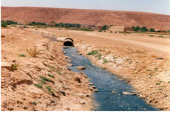
Phot. 4. Bloodletting in the bed of the river of M'zab El Atteufto channel waste water