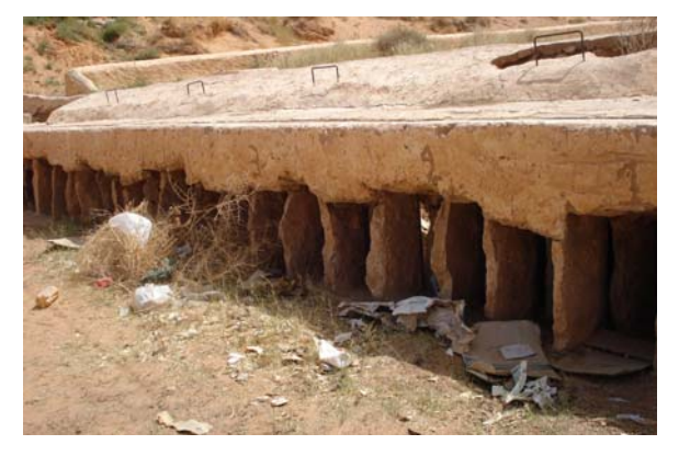
Phot. 9. Sharing system floodwaters