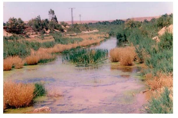
Phot. 5. Wastewater into the bed of the river, downstream of the wastewater treatment plant