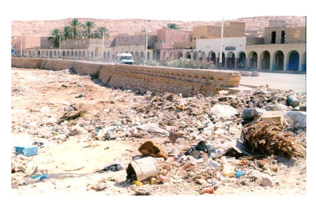
Phot. 7. Wild discharge zone in the bed of the wadi in Ghardaia