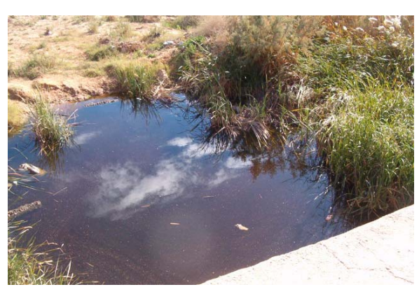
Phot. 3. Discharge of waste water into the bed of the wadi downstream Ahbass Ajdid