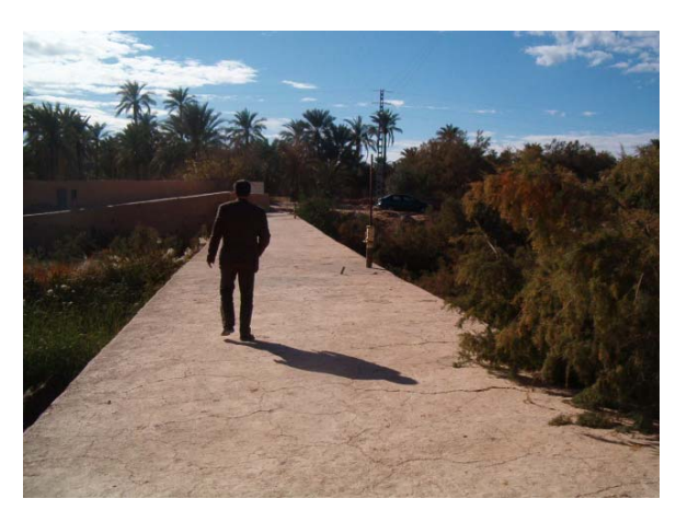
Phot. 1. Dam of Ahbas Ajdid

This is the dam the most emblematic of the M'zab valley. The dam is to cross the wadi, is based on the slope on the right bank. The dam has a spillway and a topographical closure consists of a stepped embankment on a masonry wall (Phot. 2). The main dam has suffered a major breach after the flood of 2008. Repairs and reinforcement has been made to restore its integrity. The El Atteuf dam is the last structure of M'zab River. It plays a very