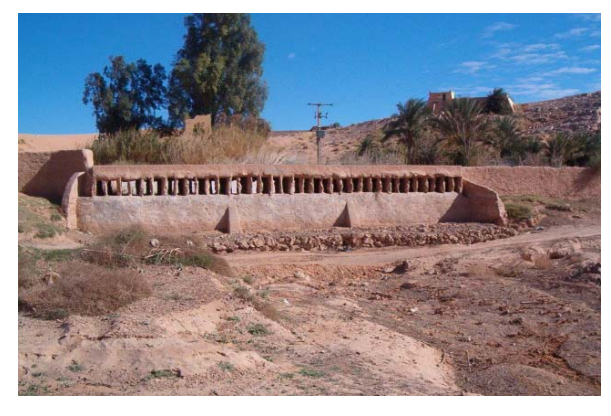
Phot. 8. Water outlet at Bouchène dam