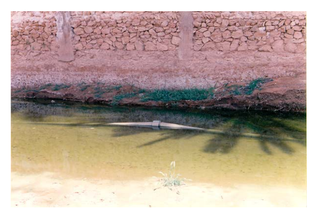
Phot. 6. Conduct of drinking water through the air zone sewage stagnation