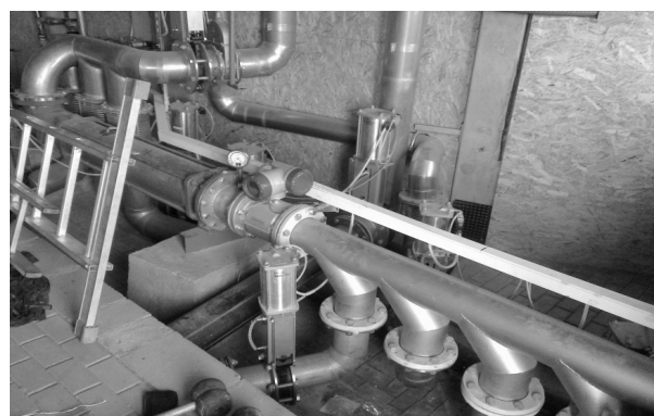
Fig. 1. Substrate-to-digestive chamber pumping system [author’s study]

Pumping station and technical room – there is a technical room between digestive chambers (dimensions: 8.87 m x 12.21 m). It is used for supervision of the operation of individual assemblies and for installation control. The room houses a pumping station (Figure 1) and a control panel in charge of the operation of the biogas plant. The control panel is used to define the volumes of the substrate charged, overall air content in the biogas and temperature in the digestive chambers. The pumping station consists of an RPM 3000E 18 kW emptying pump and a welded pumping system, DA 50 – 160, conveying the substrate under the pressure of 10 bar. The system contains an additional connection, should a new digestive chamber be connected to the substrate power feeding system.