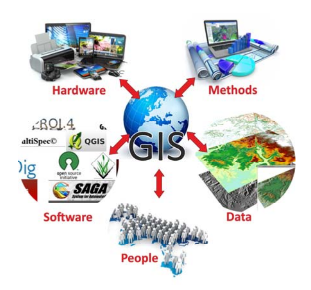
Fig. 1. Components of Geographic Information Systems; source: own study

The organization of spatial data in GIS is based on a layered structure – thematic layers – raster and vector (Fig. 2).