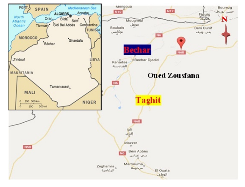
Fig. 1. Location of Taghit; source: own elaboration

Below the Grand Erg Occidental, the ksar of Taghit is connected with the palm grove by a system of Seguia and underground galleries spring water from the springs towards the gardens of the traditional palm grove (Fig. 2). Today the ksar of Taghit and suffered from several problems: every attempt at restoration failed because of a lack of expertise and poor planning, lack of skilled labour, the drying up of most of the sources that feed the ksar, Predominance of the modern urban fabric at the expense of old ksar and the degradation and weakness of the financial performance of the population.