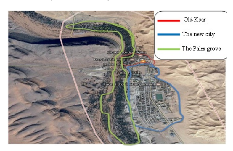
Fig. 2. The Taghit oasis