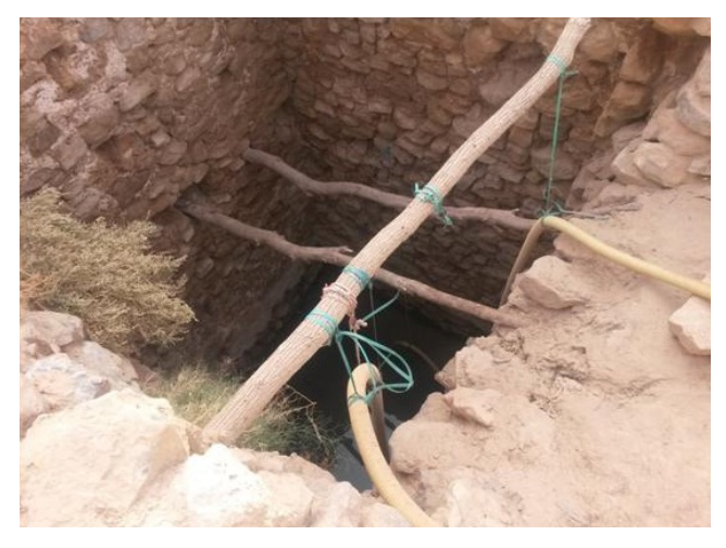
Photo 2. A traditional well in the palm grove of Taghit

In Taghit, there are over 300 traditional wells between 3 and 15 m high and 2 m in diameter, most of which are protected with concrete or stone nozzles (Photo 2). They get the waters of the Wadi Zousfana inferoflow aquifer. Most of them are equipped with motor pumps that contribute to the drying up of the water sources. Generally, traditional wells are private properties; each owner has the freedom to water their fields whenever he wants.