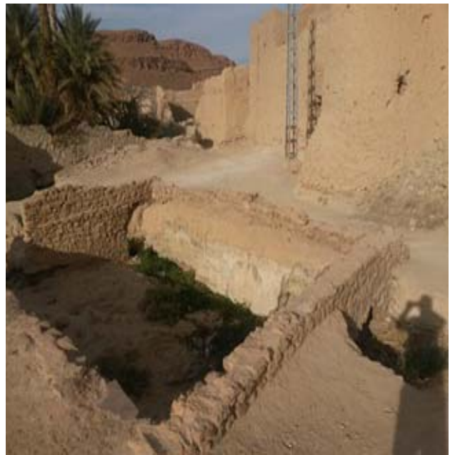
Photo 1. Old pools of water accumulation of ksar and palm grove (phot. C. Rezzoug)