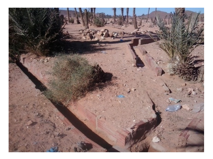
Photo 3. Degradation and silting of irrigation canals in the palm grove of Taghit

The oasis suffering today from several problems, the most important are the lack of water either for the palm grove or for the drinking water supply of the population according to the remarkable depletion of the water tables, as well as the lack of qualified manpower to rehabilitate the foggaras and these channels, degradation of the systems of catchment and sharing of water such as the irrigation canals and the accumulation basins as well as the catchment foggaras (Photo 3), the abandonment of plots because of fragmentation of gardens by inheritance, the aging of palm feet, the immigration of youth to sectors more profitable than agriculture inside the palm grove.