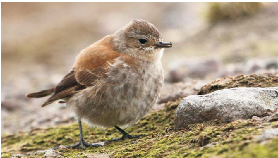
Fig. 3. Observed Austral Negrigo ( Lessonia rufa ) feeding on invertebrates, King George Island, South Shetlands, Antarctica. Image was taken by camera Canon EOS-7D and the Canon EF lens 100–400 mm f / 4.5–5.6 L IS USM.

of an adult, but back is more rufescent and underparts more whitish, which was not observed in the described case. The presence of almost all the characteristics of an adult female indicates that the observed individual was such a bird, possibly immature.