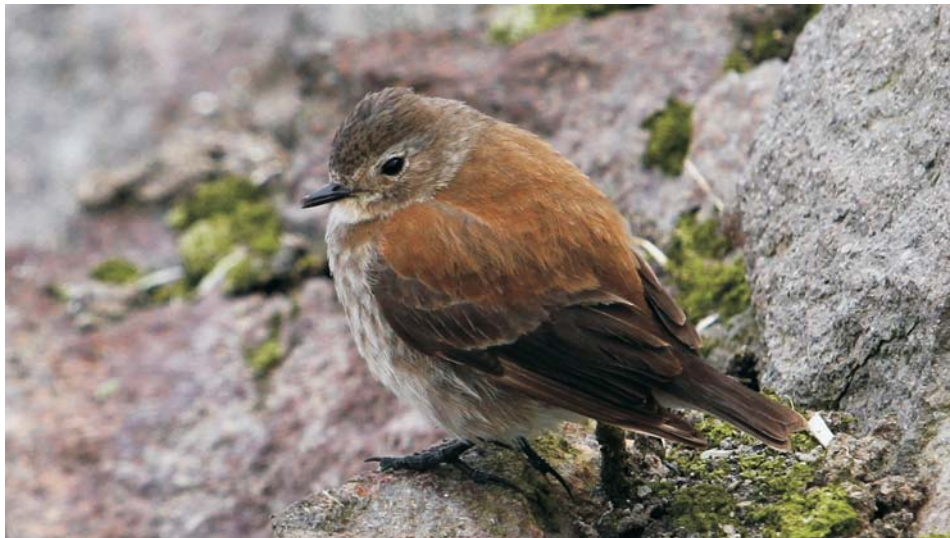
Fig. 2. Female Austral Negrigo ( Lessonia rufa ) observed at Lions Rump area, King George Island, South Shetlands, Antarctica. Image was taken by camera Canon EOS-7D and the Canon EF lens 100–400 mm f / 4.5–5.6 L IS USM.