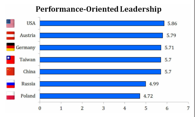
Figure 4. Mean differences between investigated leaders on performance orientation

The research results shown in Figure 4 indicate that Russian CEOs and Polish middle managers demonstrate significantly lower levels of performance orientation than