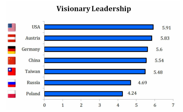
Figure 2. Mean differences between investigated leaders on visionary leadership dimension

The research results displayed in Figure 2 demonstrate substantial evidence of differences in mean scores on visionary leadership between the compared groups of leaders. Russian CEOs and Polish middle managers display significantly lower levels of visionary leadership attributes than the remaining groups of managers.