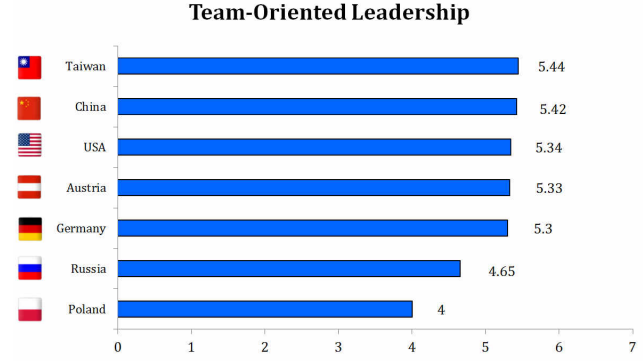
Figure 5. Mean differences between investigated leaders on team-oriented leadership dimension

Figure 5 presents the data associated with mean differences between CEOs and Polish middle managers on team-oriented leadership dimensions.