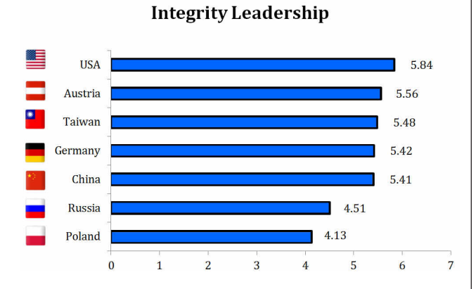
Figure 3. Mean differences between investigated leaders on integrity leadership dimension

From a comparison of research findings under the GLOBE project, Phase 3, displayed in Figure 3, it can be concluded that Russian CEOs as well as Polish middle managers score significantly lower on the integrity leadership dimension than leaders from the remaining countries.