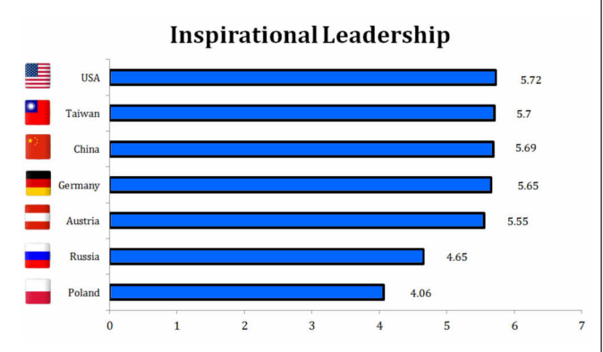
Figure 1. Mean differences between investigated leaders on inspirational leadership dimension

The research findings, displayed in Figure 1, indicate that Russian CEOs and Polish middle managers contain significantly lower levels of inspirational leadership attributes than the leaders from the remaining countries. Based on the GLOBE research findings, it was empirically demonstrated that inspirational leadership behavior is concerned with the development of enthusiasm and dedication, by affecting strong emotions in regard to subordinates needs, values, dreams and ideas.