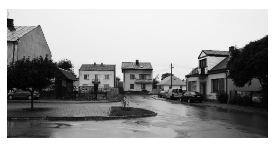
Fig. 4. Frampol's market square buildings Ryc. 4. Zabudowa przyrynkowe we Frampolu