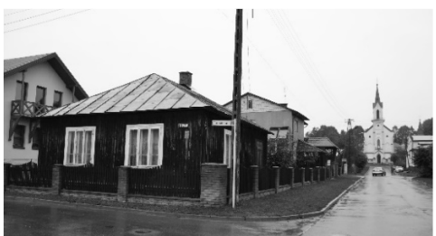
Fig. 5. Market square buildings and the church at the close of the North-South axis Fig. 5. Market square buildings and the church at the close of the North-South axis