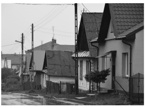
Fig. 3. Remains of Frampol's wooden buildings. Ryc. 3. Pozostałości drewnianej zabudowy