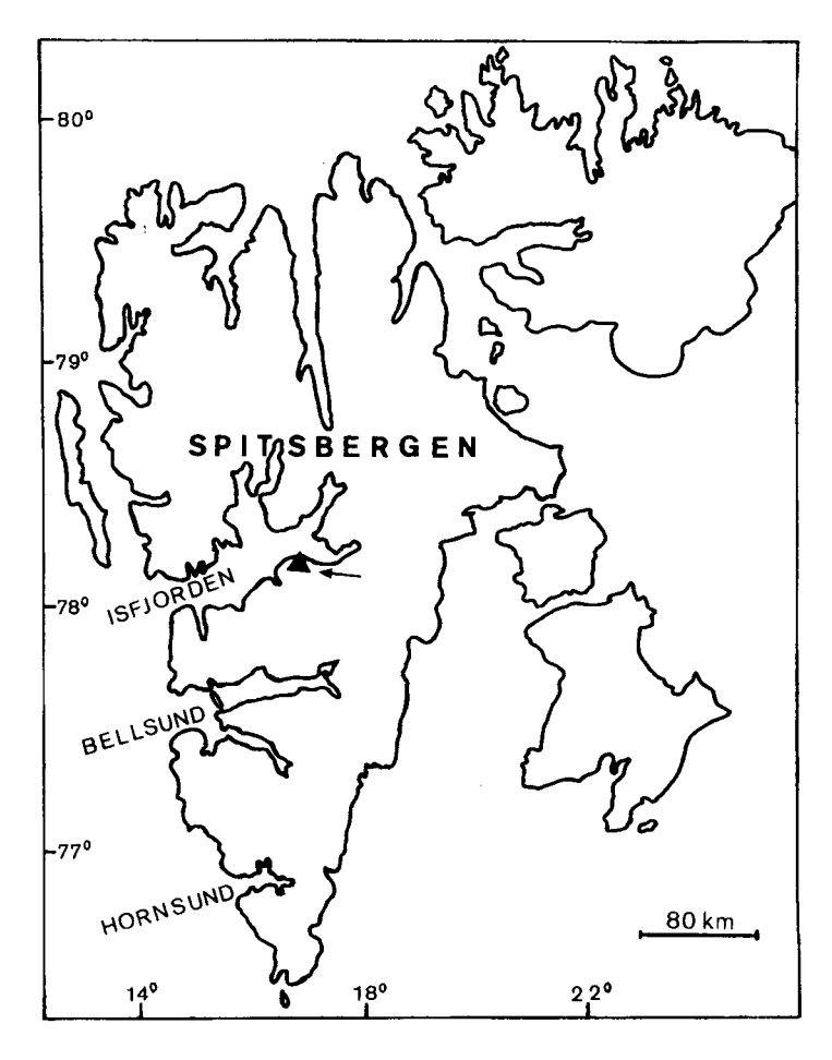
Fig. 1. Sketch-map showing location of Sassenfjorden area, central Spitsbergen investigated during the Fourth Polish Palaeontological Expedition to Spitsbergen in 1979; Sassenfjorden area arrowed.