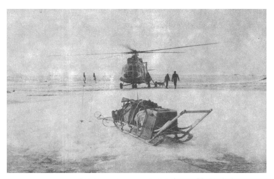
Fig. 3. Encounter during the area investigations: Norwegian helicopter and Nansen's sleigh our transport mean in winter.