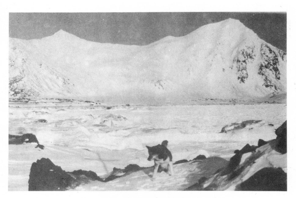
Fig. 1. Isbjørhamna (White Bear) Bay in the winter cover, March 1983. On the foreground — the Station's "Bonzo".