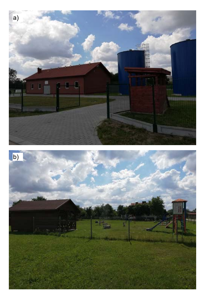
Photo 1. Investments in Szyleny: a) water and sewage project, b) playground and recreational shelter

1. In Szyleny Osada National Support Centre for Agriculture Field Branch Olsztyn modernized the water supply (Photo 1a), where two new deep wells, two retention reservoirs, a water treatment station and a sewage network were made. The land was also donated, on which the municipality built a playground and a recreational shelter (Photo 1b) and modernized the road and football field.