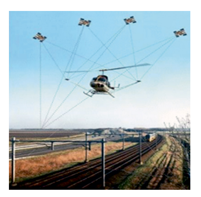
Fig. 2. Using helicopter equipped with a scanning laser

Selected information technology tools supporting maintenance and operation management electrical grids