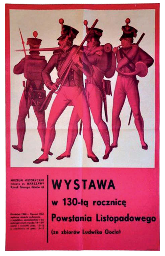
Fig. 2. The poster prepared on the occasion of an exhibition organized in the Historical Museum of Warsaw in 1960 on the 130th anniversary of the November Uprising, graphic design by Julian Pałka.

In 1965, The Polish Review, in its "Book Reviews" section, printed a review of two Polish publications devoted to the November Uprising.<sup>10</sup> One of these works was an illustrated brochure prepared on the occasion of an exhibition organized in Warsaw in 1960 on the one 130<sup>th</sup> anniversary of the Uprising.