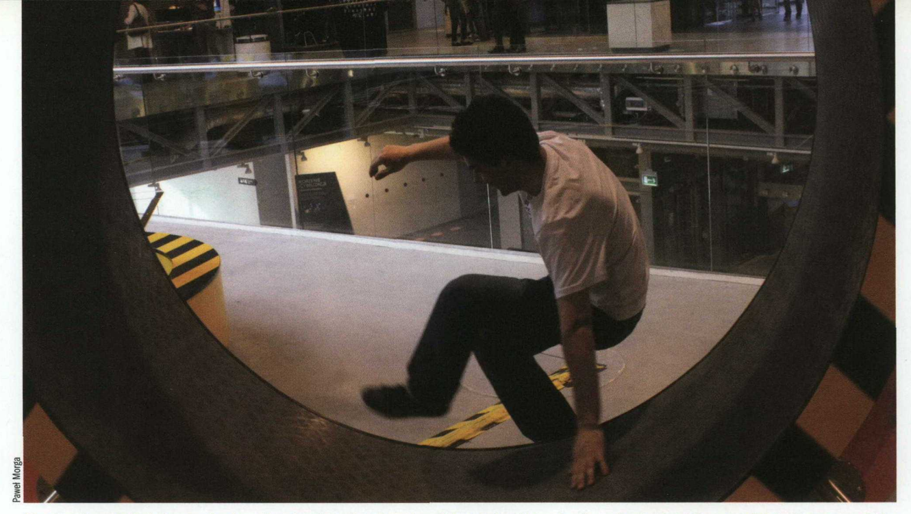
We value science festivals because they have allowed participants to "experience" the experiment by performing and evaluating it themselves. This hands-on approach also lies at the heart of successful learning centers

sometimes invited to create groups where specific problems were discussed. How can we best depict experimental science? How can we draw in various excluded social groups? How do we get children to "get" science? How much art is there in science? What is the best way to harness social networking sites? How can we work with schools and teachers? Common answers to such questions were sought, and the participants had a chance to voice and defend (many) different views. In fact, the dominant impression of this conference was that it draws all participants into active thinking and teaches them how to engage an audience.