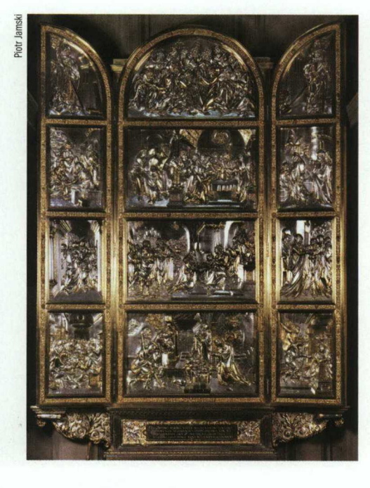
In 1538 the Chapel was embellished with this exquisite alter of gilded silver, the work of artists from Nüremberg

Mossakowski S. (2006). Kaplica Zygmuntowska (1515–1533). Problematyka artystyczna i ideowa mauzoleum Zygmunta I [The Sigismund Chapel (1515–1533) – Artistic and conceptual issues of the mausoleum of King Sigismund]. Warsaw: Liber pro Arte.