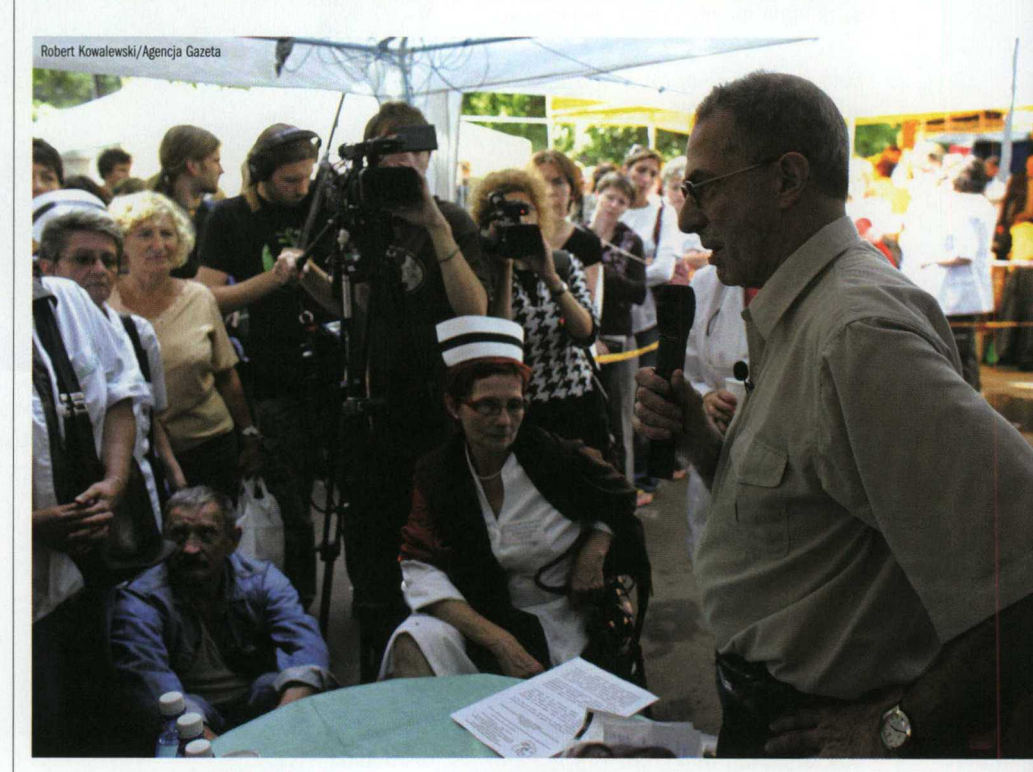
Karol Modzelewski lecturing on "Conflict and Negotiations - The Experience of the First Solidarity" as part of the "White University" lectures organized during the protest staged by nurses outside the Polish Prime Minster's office in July 2007

One has to regret its loss, yet we should keep in mind that it does live on in contemporary times, it has not disappeared without a trace. The most dramatic moment of Christianization described by the sources (mainly of missionary origin) is the point when not individual people but whole conquered political communities of the