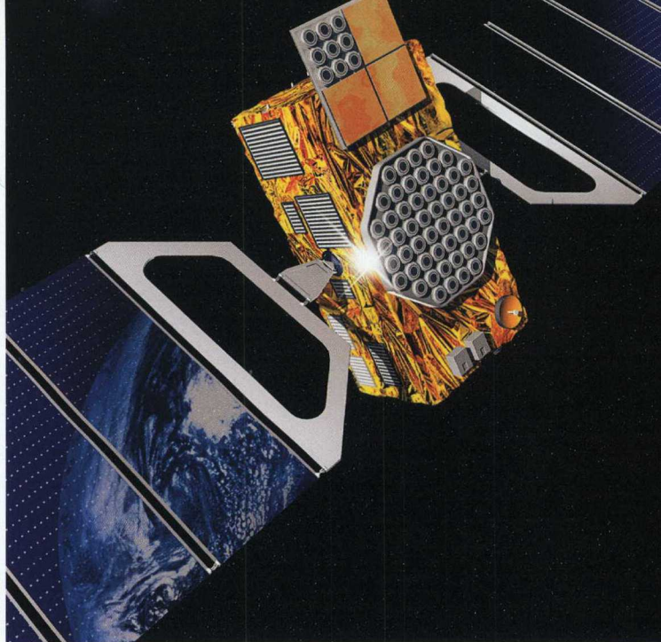
ESA - J. Huart

The future implementation of GALILEO will bring with it a range of new applications. Some of them are being developed based on the existing GPS technology, but will be improved and adapted to Galileo in the future. One good example is the Geodetic Active Network developed in cooperation with the National Office of Geodesy and Cartography. The aim of this project is to improve services in surveying and mapping and different kinds of precise positioning, and to make them more precise. At present 10 stations are active in the south of Poland while a few others provide reference data. When completed, this system will be easily adapted for dual GPS/Galileo use. GALILEO activity in Poland is coordinated by the "GALILEO Information Point" established by the Space Office of the PAN Space Research Centre.