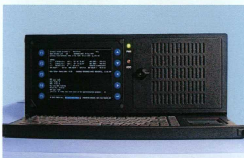
The Time Transfer receiver developed at the Astrogeodynamical Observatory of the PAN Space Research Centre

to a number of time observatories around the world.