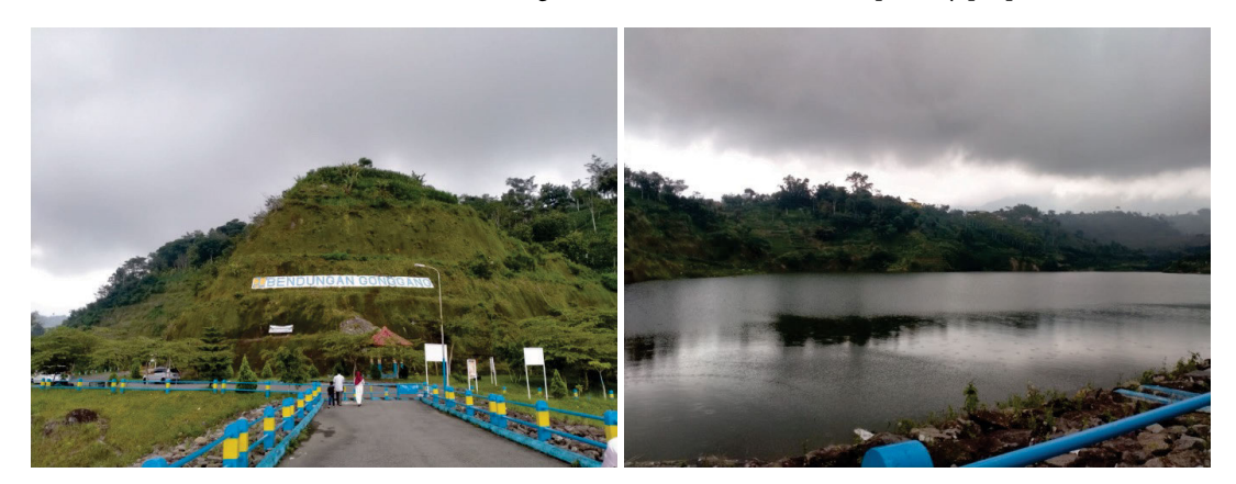
Photo 1. Gonggang reservoir condition in 2021

The Gonggang reservoir is in Janggan Village, Poncol Subdistrict, Magetan District. The Gonggang reservoir (Photo 1) was built in 2006 with the primary purpose as the source of irrigation