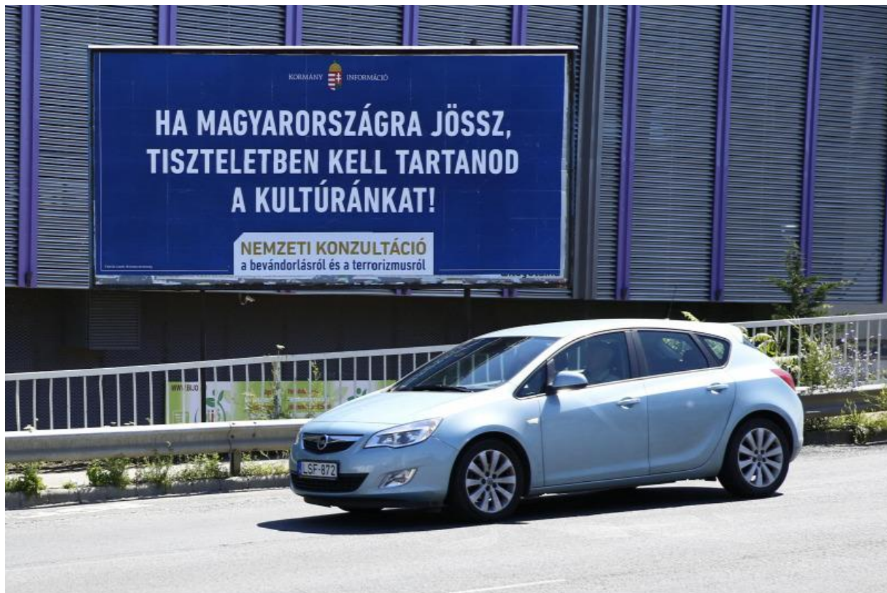
Figure 2. National consultation billboard: ‘If you come to Hungary, you have to respect our culture’