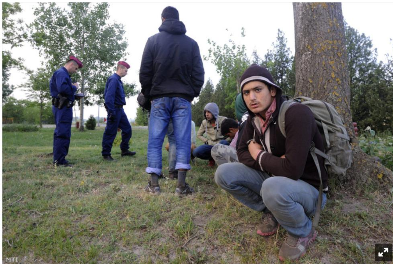
Figure 3. A typical illustration of refugees in 2015 in the non-government media