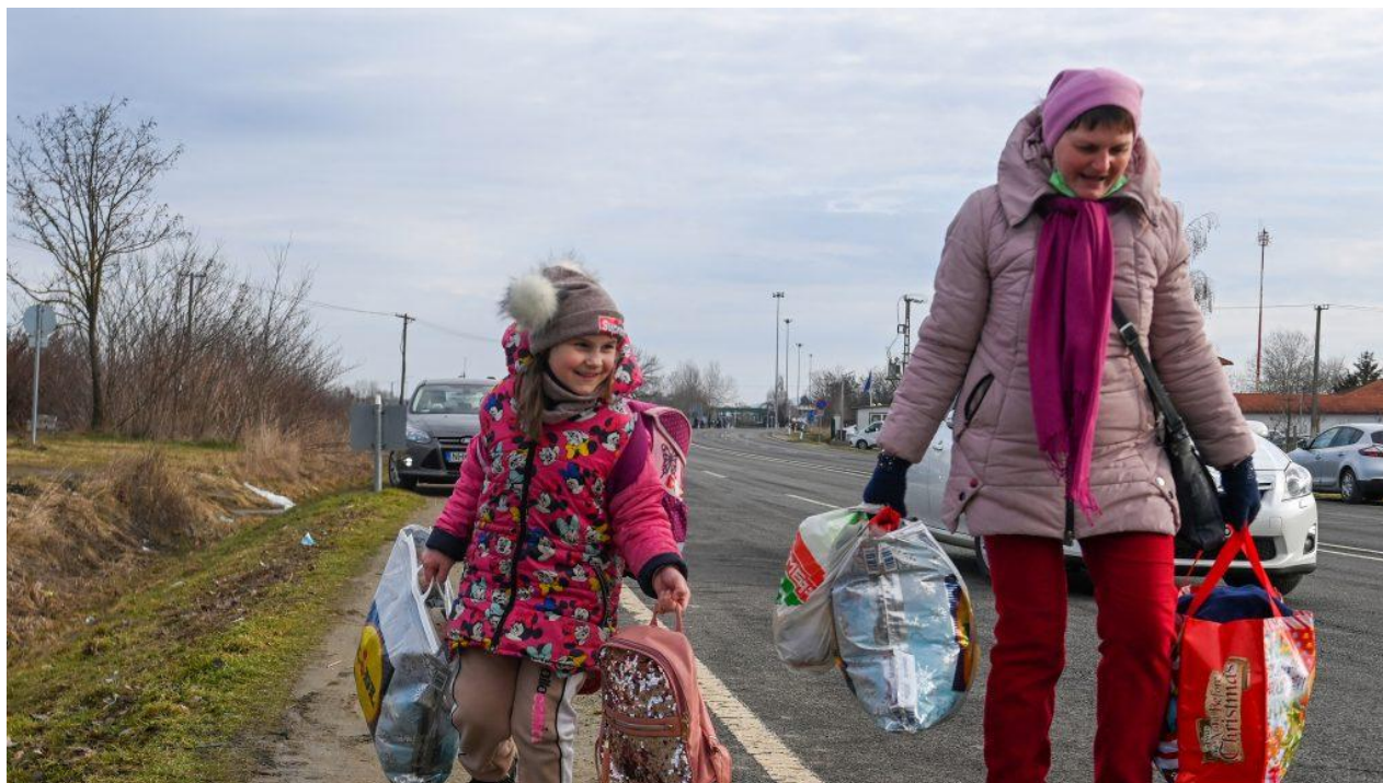
Figure 4. A typical illustration of refugees in 2022