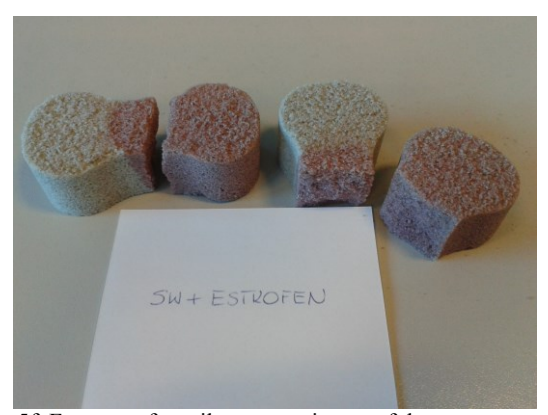
Fig. 5f. Fracture of tensile test specimens of the system: waterglass + Estrofen, after 24h

(Contrary to the system Geopol+Rezolit after 3h the fracture occurs at the boundary of two sands, while after 24h in the sand with the Estrofen resin, since the binding of two sands strengthened).