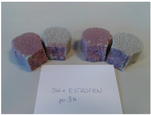
Fig. 5e. Fracture of tensile test specimens of the system: waterglass + Estrofen, after 3h

(The fracture of the tensile test specimen of the system: Geopol+Estrofen after 24h - occurs in the sand with the Estrofen resin)