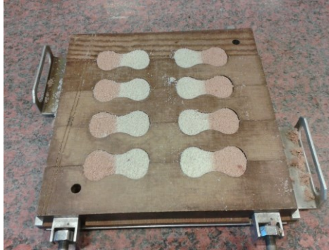
Fig. 3. Two-layer tensile test specimen for measuring the tensile strength after compaction