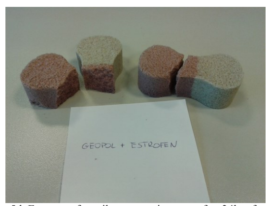
Fig. 5d. Fracture of tensile test specimens – after 24h – for the system: Geopol + Estrofen (The fracture of the tensile test specimen of the system:

resin, while after 24h - at the boundary of two sands)