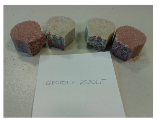
Fig. 5c. Fracture of tensile test specimens - after 24h – of the system: Geopol + Rezolit (The fracture of the tensile test specimen of the system: Geopol+Rezolit after 3h - occurs in the sand with the Rezolit

resin, while after 24h - at the boundary of two sands)