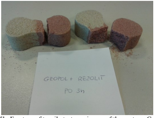
Fig. 5b. Fracture of tensile test specimens of the system: Geopol + Rezolit (after 3h)