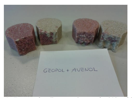
Fig. 5a. Fracture of tensile test specimens - after 24 h - of the system: Geopol + Avenol (Tensile failure occurred at the boundary of two sands)

Cross-sections of binding of two sands in the place, in which they were fractured are shown in Fig. 5 (a-f).