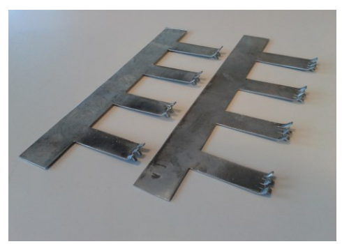
Fig. 1. Partition with cuts separating two kinds of sands when making tensile test specimens

The LUZ apparatus, produced by Multiserw Morek, was adapted for investigations. A special partition with cuts was mounted in the attachment for making test specimens for measuring the tensile strength. This partition allowed a simultaneous compaction of two kinds of moulding sands (Fig. 1 - 3). Its shape was the result of several tests concerning the proper compaction and binding of both sands.