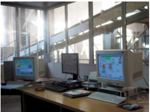
Fig. 3. A detail from the command post of the Majdan III open pit mine showing ECS control system