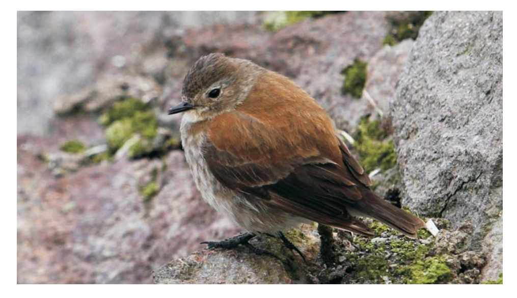
Fig. 2. Female Austral Negrito ( Lessonia rufa ) observed at Lions Rump area, King George Island, South Shetlands, Antarctica. Image was taken by camera Canon EOS-7D and the Canon EF lens 100–400 mm f / 4.5–5.6 L IS USM.