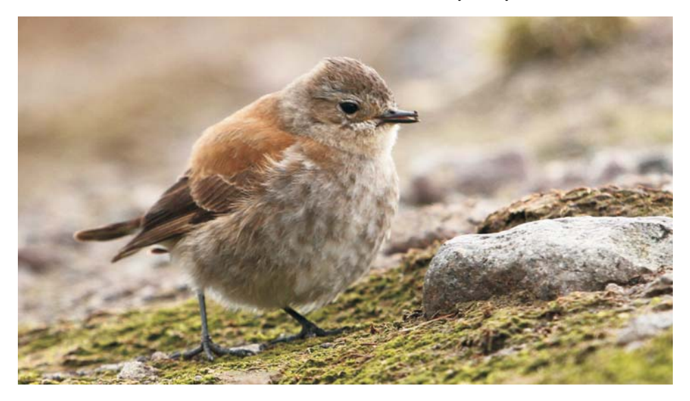
Fig. 3. Observed Austral Negrito ( Lessonia rufa ) feeding on invertebrates, King George Island, South Shetlands, Antarctica. Image was taken by camera Canon EOS-7D and the Canon EF lens 100–400 mm f / 4.5–5.6 L IS USM.

of an adult, but back is more rufescent and underparts more whitish, which was not observed in the described case. The presence of almost all the characteristics of an adult female indicates that the observed individual was such a bird, possibly immature.